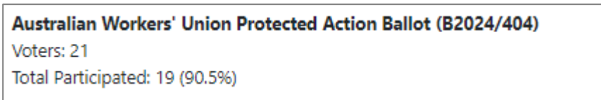
Diagram 1: Final Vote Participation

Final Ballot Audit: Friday, 26 April 2024 at 10.00am AWST