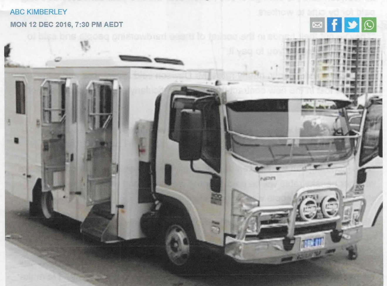
PHOTO Custodial and court security officers face pay cuts under a change of contractor, according to their union.

WA Court security and custodial officers face pay cut under new contract, union says