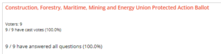
Diagram 1: Final Vote Participation

Final Ballot Audit: Friday, 11 March 2022 at 12.05 pm AWST