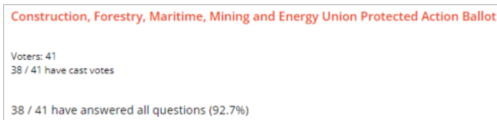
Diagram 1: Final Vote Participation

Final Ballot Audit: Friday, 15 July 2022 at 2.15 pm AWST