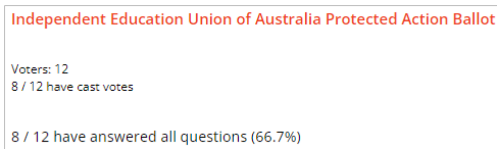
Diagram 1: Final Vote Participation

Final Ballot Audit: Monday, 19 September 2022 at 2.25pm AWST