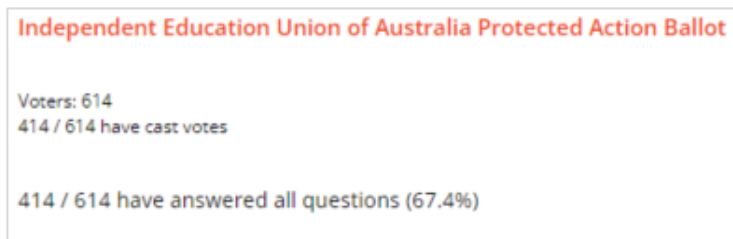
Diagram 1: Final Vote Participation

Final Ballot Audit: Tuesday, 17 May 2022 at 3.20pm AWST