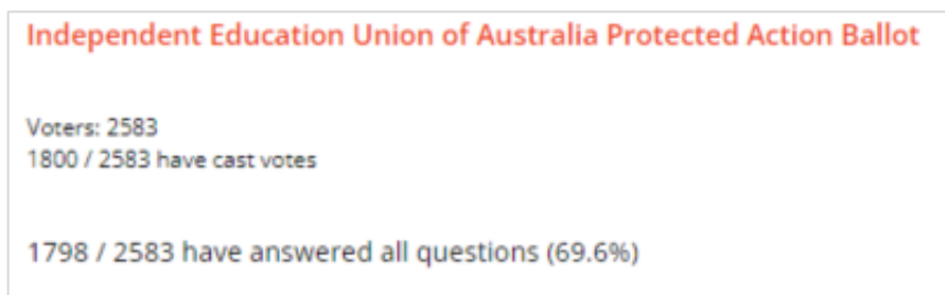
Diagram 1: Final Vote Participation

Final Ballot Audit: Tuesday, 17 May 2022 at 3.50pm AWST