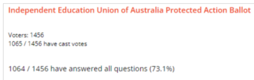
Diagram 1: Final Vote Participation

Final Ballot Audit: Tuesday, 17 May 2022 at 3.30pm AWST