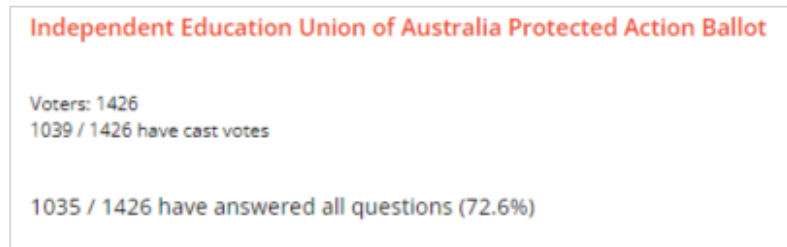
Diagram 1: Final Vote Participation

Final Ballot Audit: Tuesday, 17 May 2022 at 4.05pm AWST