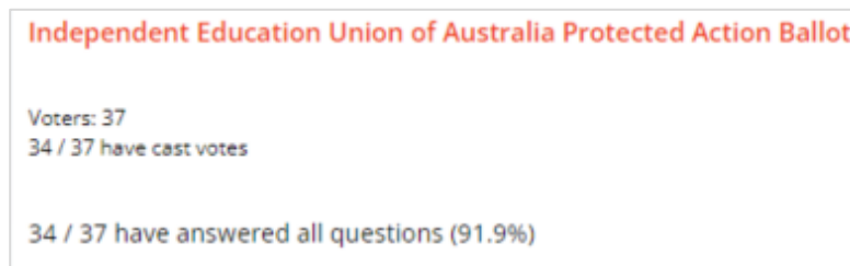
Diagram 1: Final Vote Participation

Final Ballot Audit: Thursday, 23 June 2022 at 2.10 pm AWST