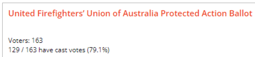
Diagram 1: Final Vote Participation

Final Ballot Audit: Wednesday, 27 July 2022 at 1.01pm AEST