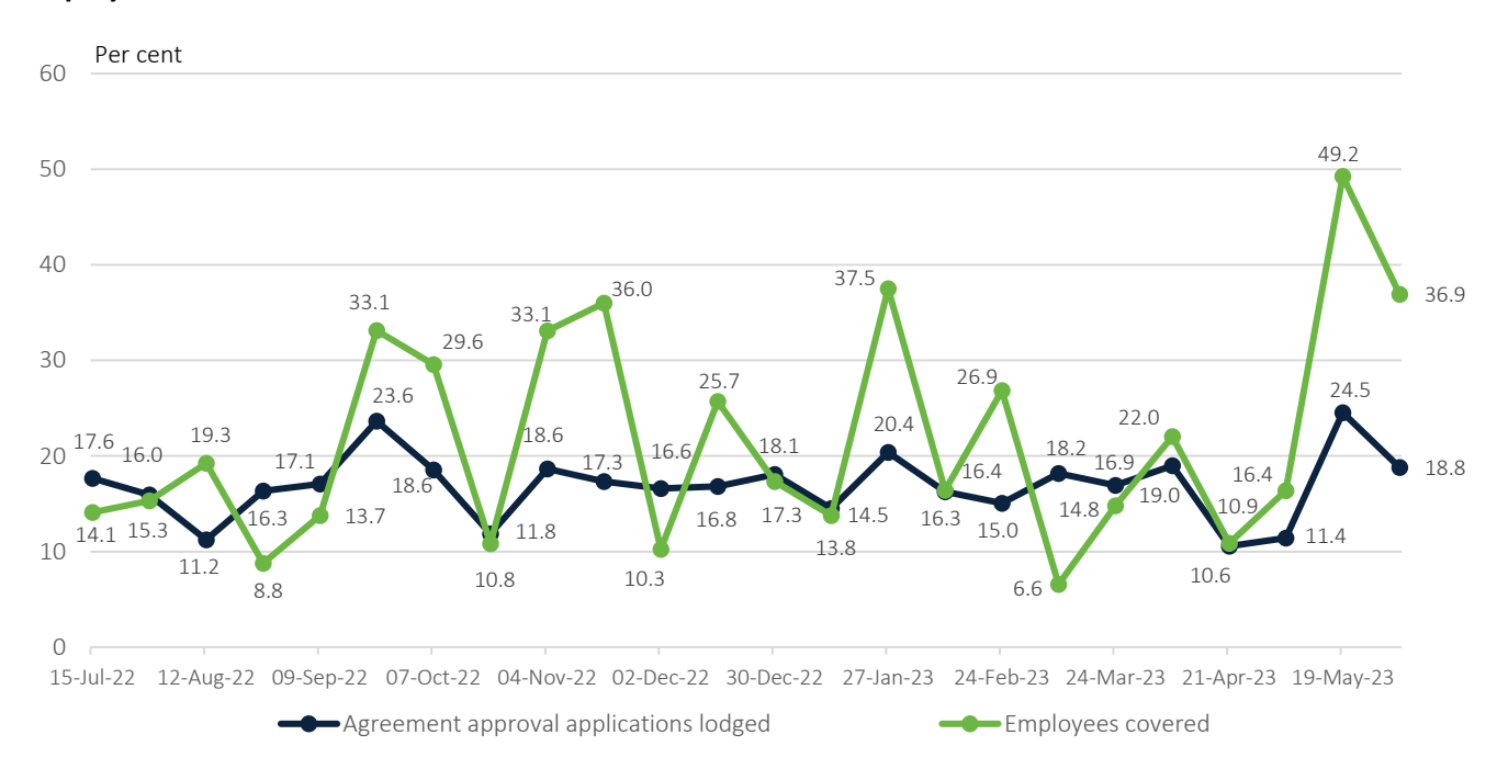
Chart 1.2: Non-quantifiable agreements, proportion of agreement approval applications lodged and employees covered