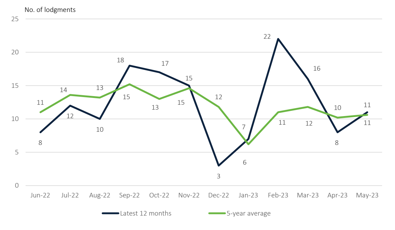
Chart 2.5: Applications lodged to deal with a bargaining dispute, s.240