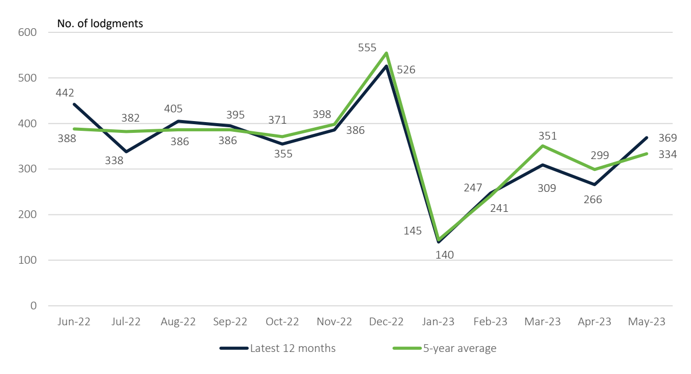
Chart 2.1: Number of agreement approval applications lodged, s.185

Note: This data series contains applications subsequently withdrawn or converted (varied) by the applicant. See Data Definitions for further information.