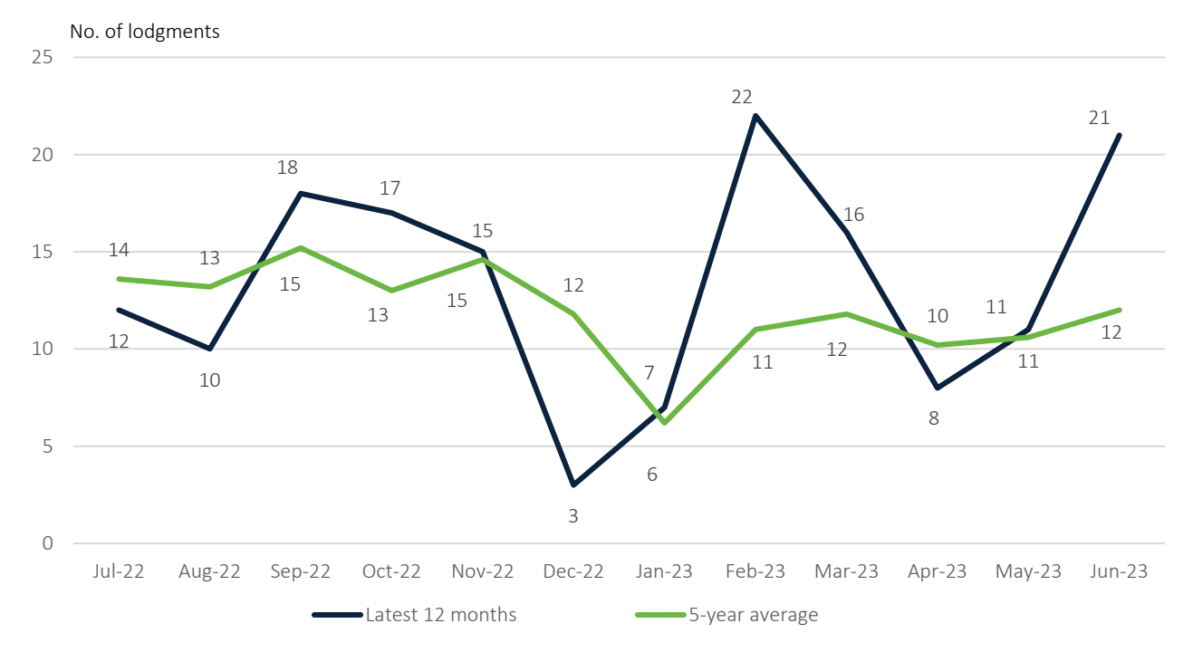
Chart 2.5: Applications lodged to deal with a bargaining dispute, s.240