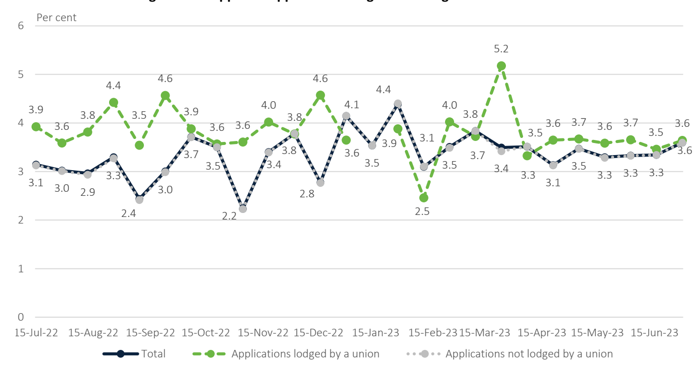
Chart 1.1: AAWI for agreement approval applications lodged in fortnight

Note: Applications lodged by a union do not capture all applications with union involvement. Refer to the definition of 'application lodged by a Union' in the data definitions section of this report for further detail. Data for the fortnight 3 June – 16 June 2023 have been revised.