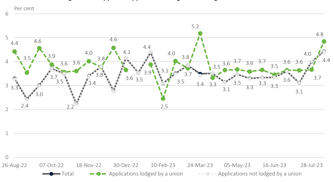
Chart 1.1: AAWI for agreement approval applications lodged in fortnight

Note: Applications lodged by a union do not capture all applications with union involvement. Refer to the definition of 'application lodged by a Union' in the data definitions section of this report for further detail.