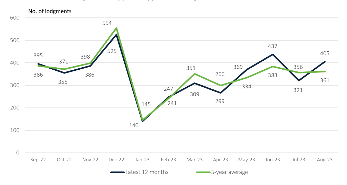
Chart 2.1: Number of agreement approval applications lodged, s.185

Note: This data series contains applications subsequently withdrawn or converted (varied) by the applicant. See Data Definitions for further information.