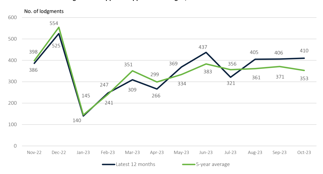
Chart 2.1: Number of agreement approval applications lodged, s.185

Note: This data series contains applications subsequently withdrawn or converted (varied) by the applicant. See Data Definitions for further information.