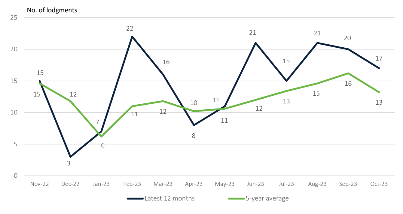
Chart 2.5: Applications lodged to deal with a bargaining dispute, s.240