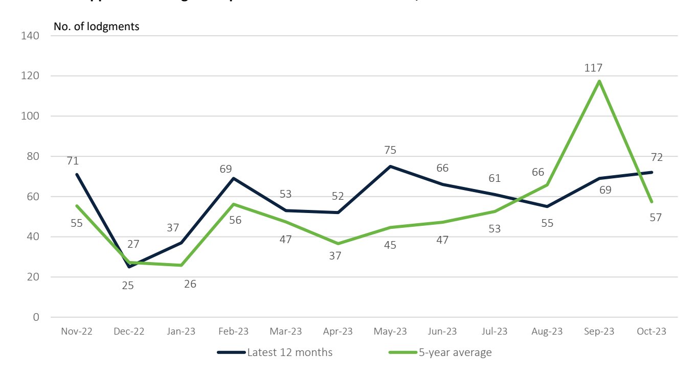
Chart 2.2: Applications lodged for protected action ballot orders, s.437