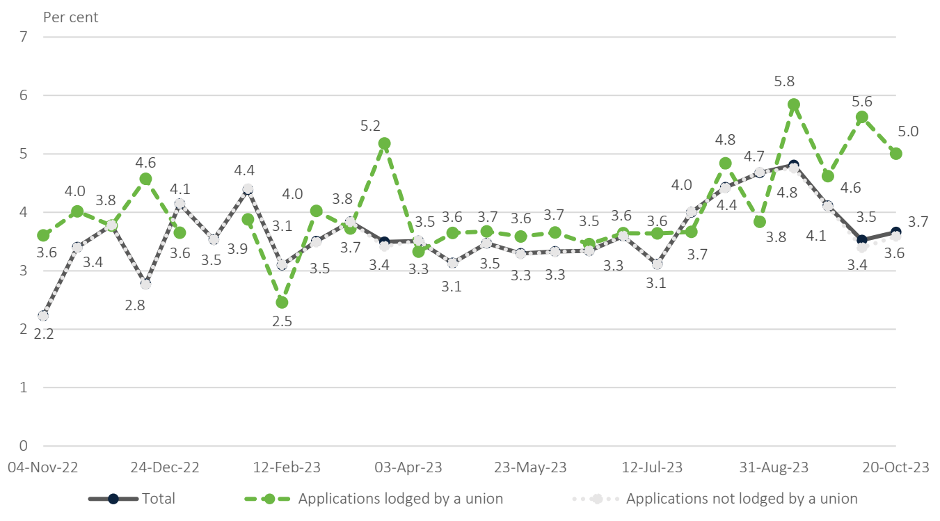
Chart 1.1: AAWI for agreement approval applications lodged in fortnight

Note: Applications lodged by a union do not capture all applications with union involvement. Refer to the definition of 'application lodged by a Union' in the data definitions section of this report for further detail.