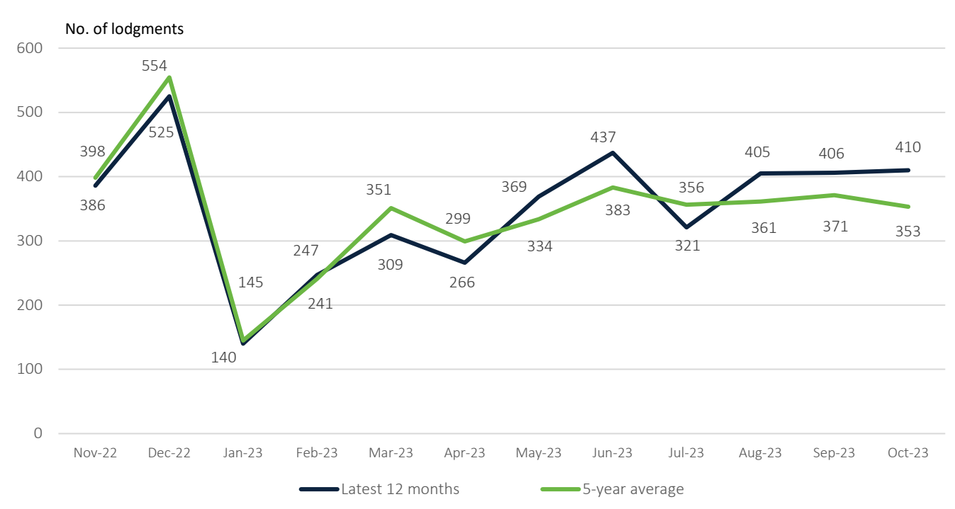
Chart 2.1: Number of agreement approval applications lodged, s.185

Note: This data series contains applications subsequently withdrawn or converted (varied) by the applicant. See Data Definitions for further information.