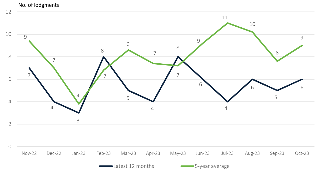
Chart 2.3: Applications lodged for majority support determination, s.236