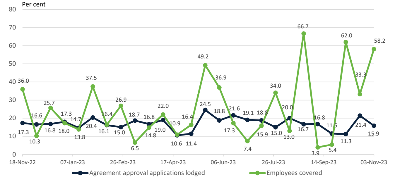
Chart 1.2: Non-quantifiable agreements, proportion of agreement approval applications lodged and employees covered*