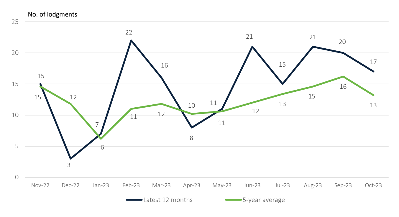
Chart 2.5: Applications lodged to deal with a bargaining dispute, s.240