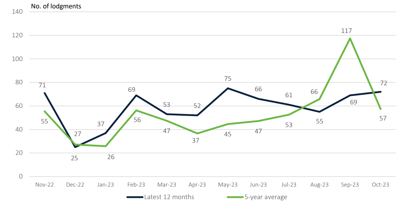
Chart 2.2: Applications lodged for protected action ballot orders, s.437