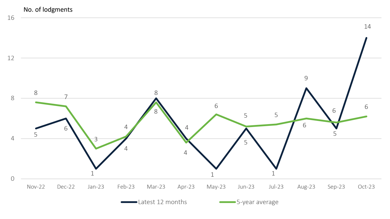
Chart 2.4: Applications lodged for a bargaining order, s.229