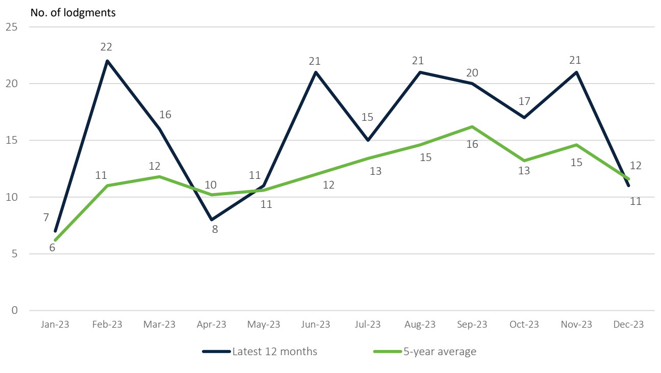
Chart 2.5: Applications lodged to deal with a bargaining dispute, s.240