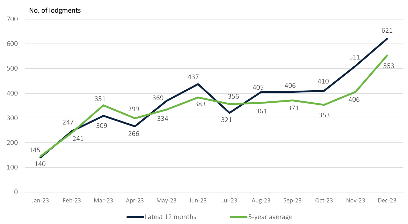
Chart 2.1: Number of agreement approval applications lodged, s.185

Note: This data series contains applications subsequently withdrawn or converted (varied) by the applicant. See Data Definitions for further information.