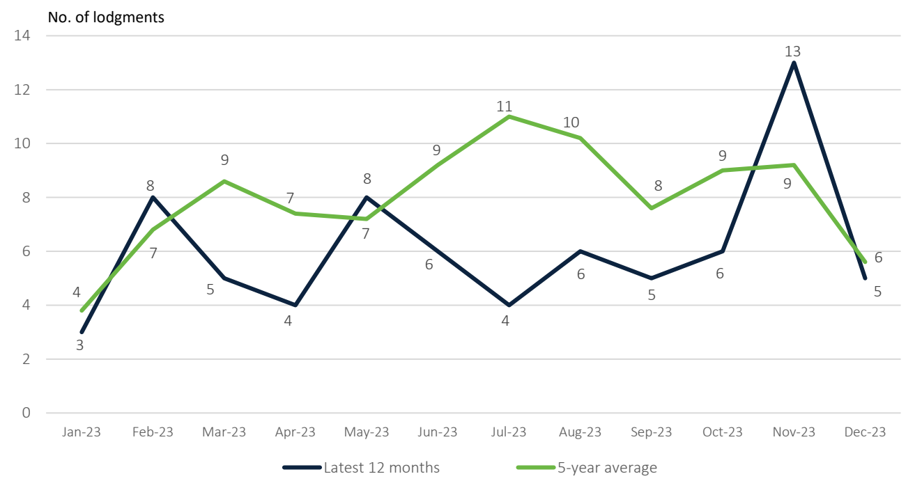
Chart 2.3: Applications lodged for majority support determination, s.236