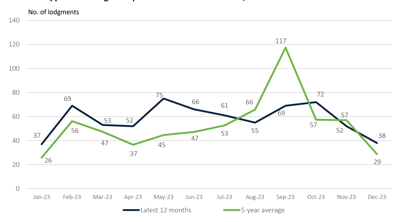
Chart 2.2: Applications lodged for protected action ballot orders, s.437