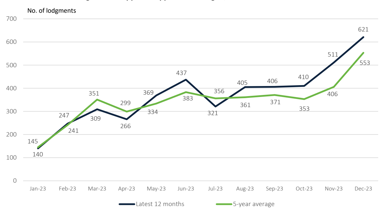
Chart 2.1: Number of agreement approval applications lodged, s.185

Note: This data series contains applications subsequently withdrawn or converted (varied) by the applicant. See Data Definitions for further information.