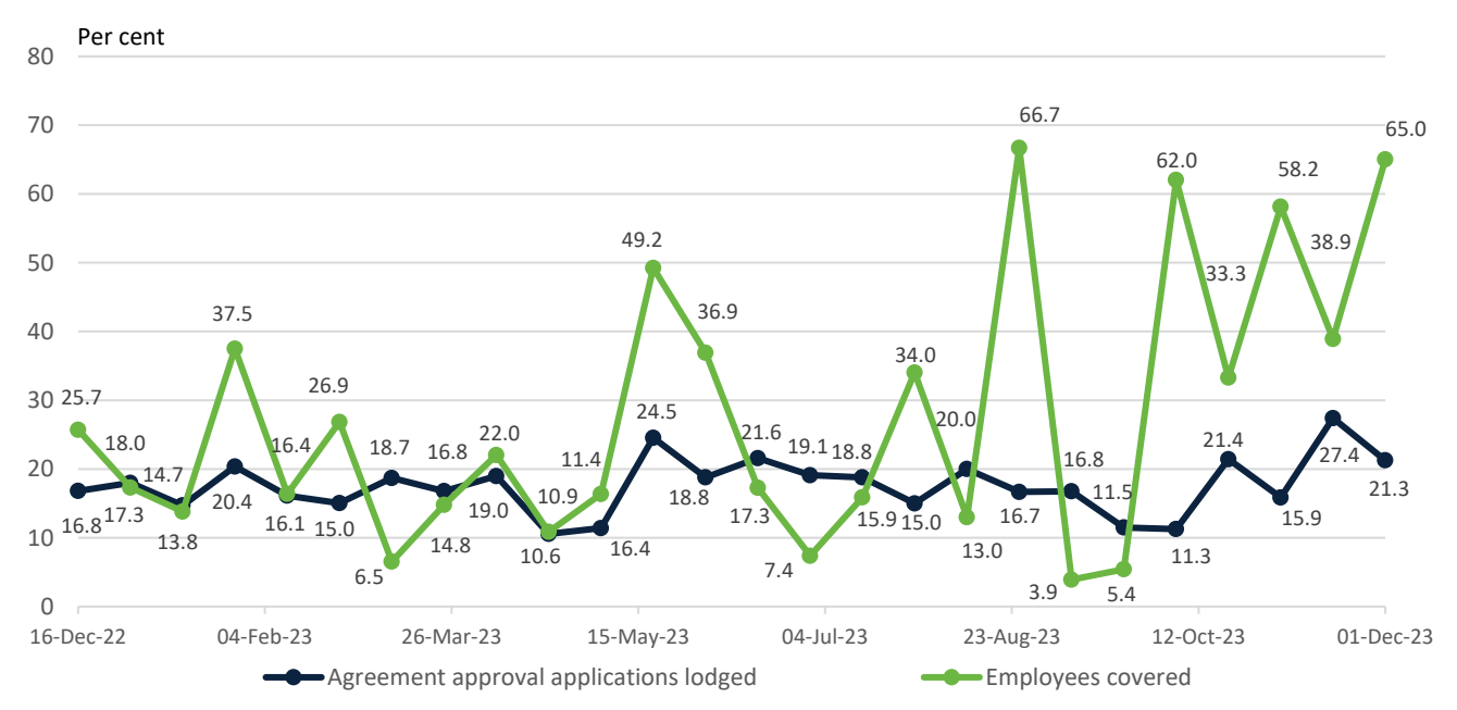
Chart 1.2: Non-quantifiable agreements, proportion of agreement approval applications lodged and employees covered