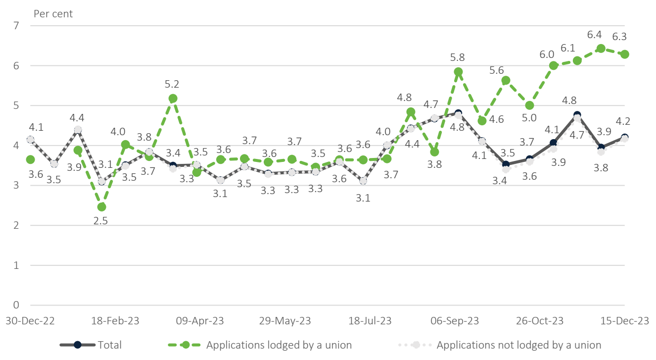
Chart 1.1: AAWI for agreement approval applications lodged in fortnight

Note: Applications lodged by a union do not capture all applications with union involvement. Refer to the definition of 'application lodged by a Union' in the data definitions section of this report for further detail.